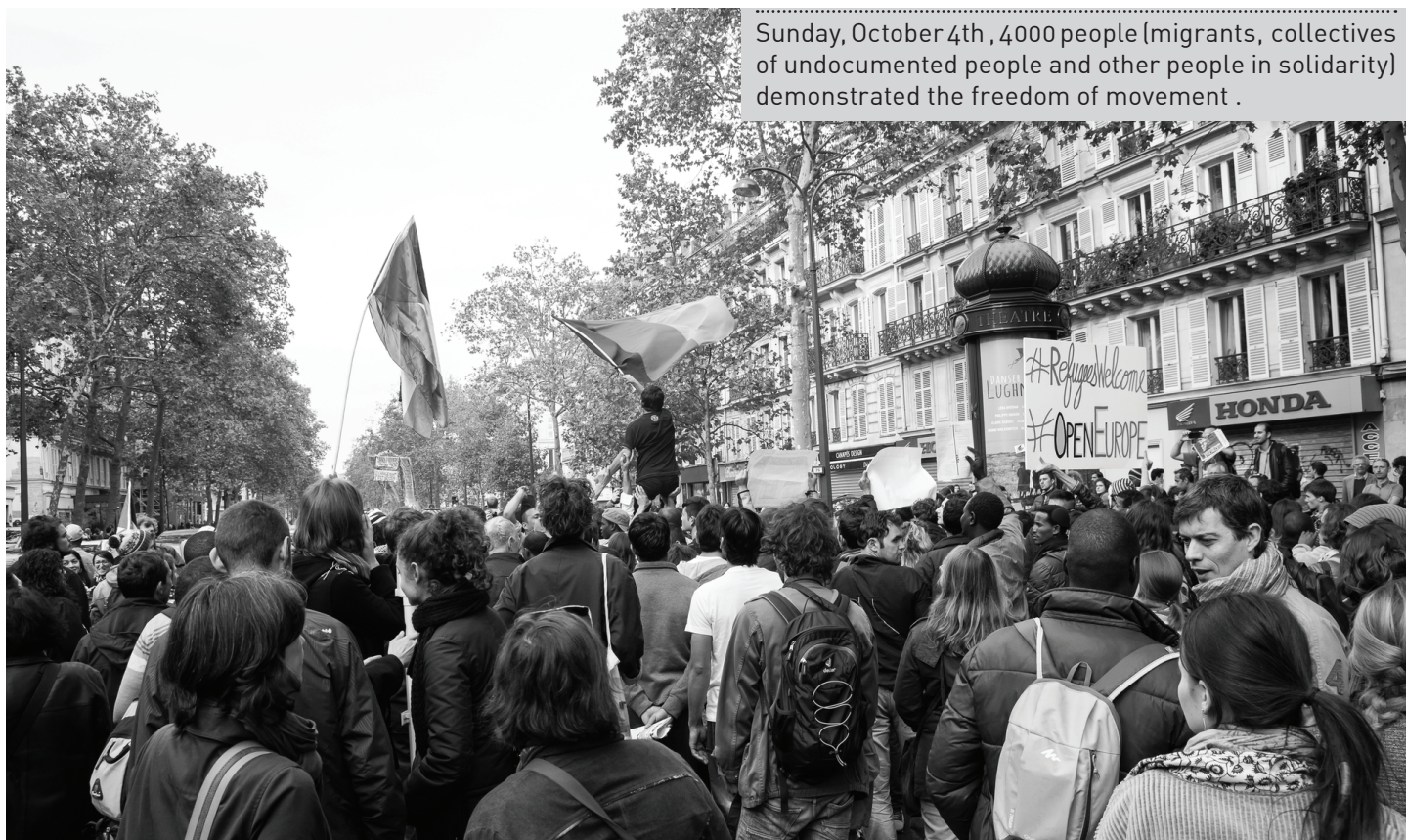
Sunday, October 4th, 4000 people (migrants, collectives of undocumented people and other people in solidarity) demonstrated the freedom of movement .

RALLY IN FRONT OF THE POLICE PREFECTURE OF PARIS THURSDAY, NOVEMBER 6H, AT 2PM 92 boulevard Ney subway « Porte de Clignancourt »