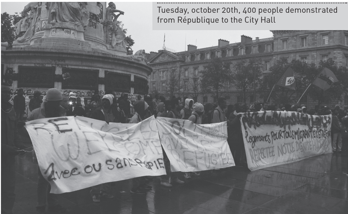
Tuesday, october 20th, 400 people demonstrated from République to the City Hall

THIS NEWSPAPER IS DISTRIBUTED AS WIDELY AS POSSIBLE AND AVAILABLE AT THE OCCUPIED SCHOOL OF PLACE DES FÊTE (RUE JEAN QUARRÉ)